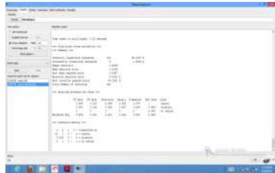
Figure5.2.Run Information In Naïve Bayes Algorithm