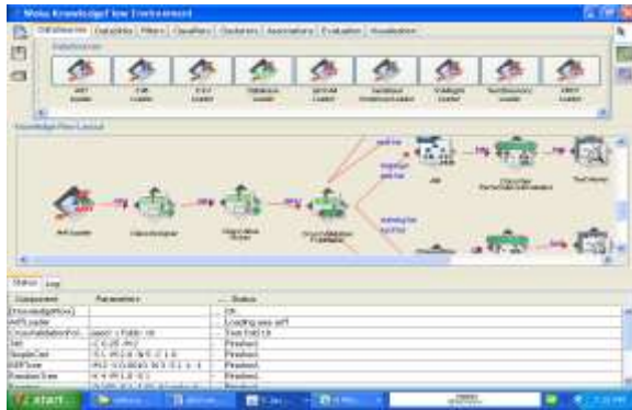
Figure .3.3: The WEKA Knowledge Flow user interface