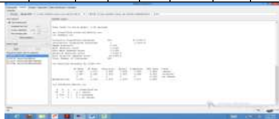
Figure 5.1.Run information in J48 Algorithm